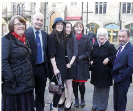
A day to remember for new Freemen and their families.

At the time of writing a further nine applications have been received and should move through to first call at the Candlemas Guild Day on 4 February 2013.