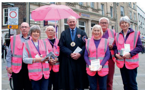
Durham City Pointers with the Chairman of the Wardens

A dedicated group of volunteers, who point the way for tens of thousands of tourists who visit Durham each summer, have themselves been given a helping hand by the City's Freemen.