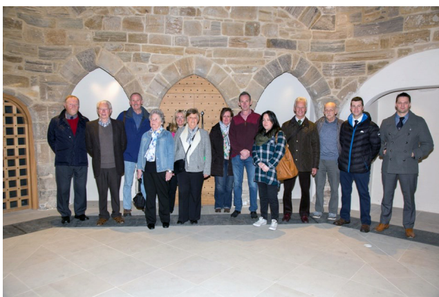
Tour party in the Great Kitchen