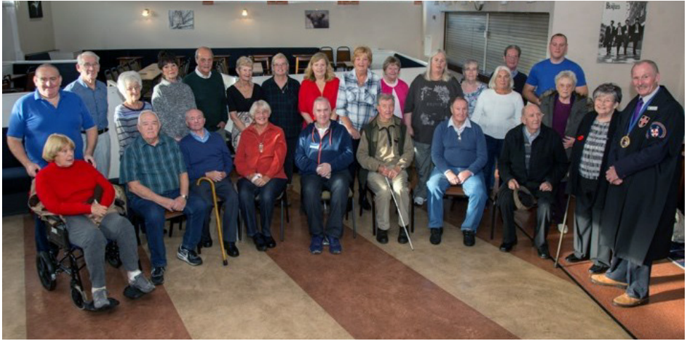
Members of the Stroke Club

Stroke victims are being kept on the road to recovery with a £1,000 gift from the City of Durham Freeman. The money, donated to the County Durham Stroke Club, will cover the year-long costs of a vital transport link for handicapped clients who would otherwise be stranded at home.