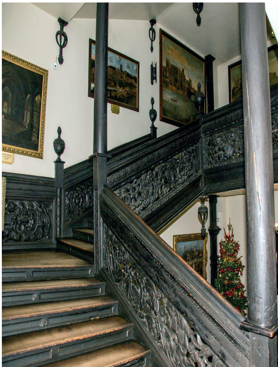
The Black Staircase Durham Castle