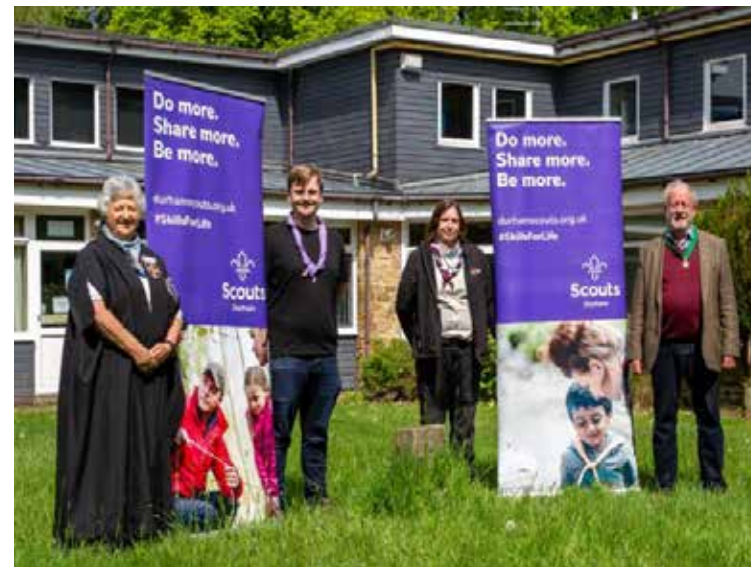
Left to right

"As well as the house we have a permanent tented village within the grounds and can on occasion, cater for jamborees for up to 3,000. The dorm provides residential opportunities for 40 young people and allows them the chance to tackle a variety of outdoor skills and qualify for badges during their stay.