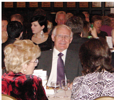
Annual Dinner at Town Hall